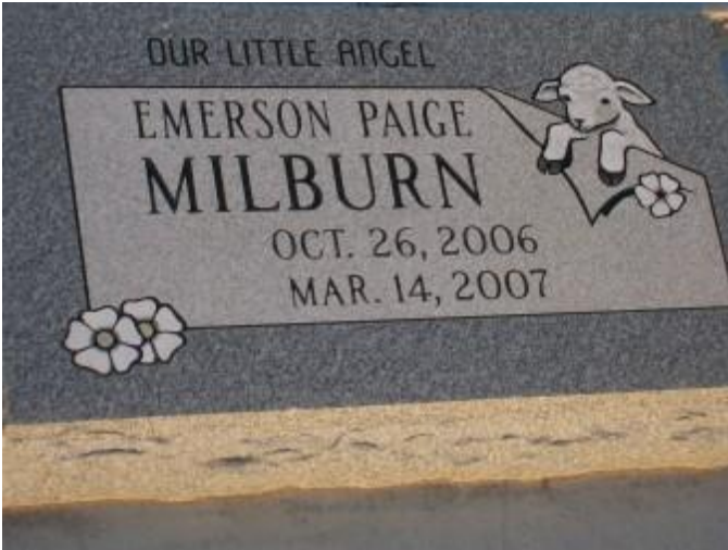
One of hundreds of child graves in Peaceful Valley Cemetery